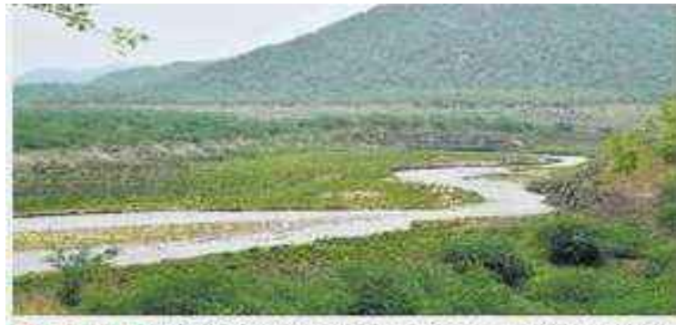
Riparian wees: The Cauvery flowing near Salem. • ELAKSHM MARAYANAN