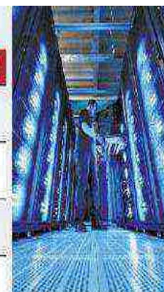
Rpeak values are based on clock rate of CPU